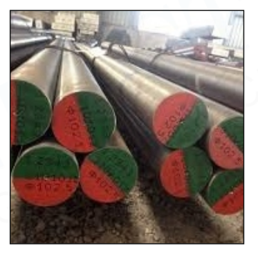
AISI H-11 / DIN 1.2343