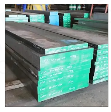
AISI P20 / DIN 1.2311