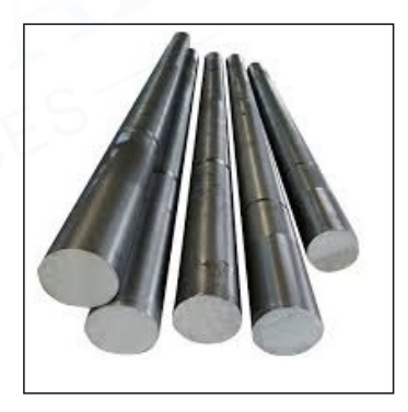
AISI H-12/ DIN 1.606