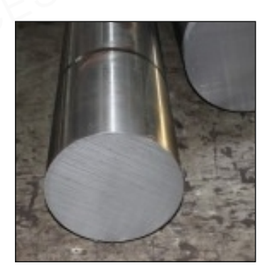
AISI OHNS-01 / DIN 1.2510