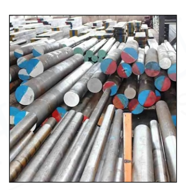
AISI 4140 / EN 19