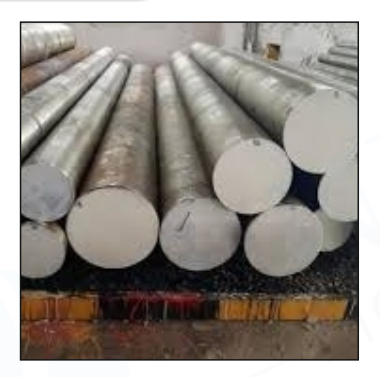
AISI H-13 / DIN 1.2344