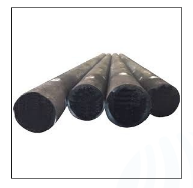
AISI DB6/ DIN 1.2714