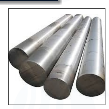
AISI 4340 / EN 24