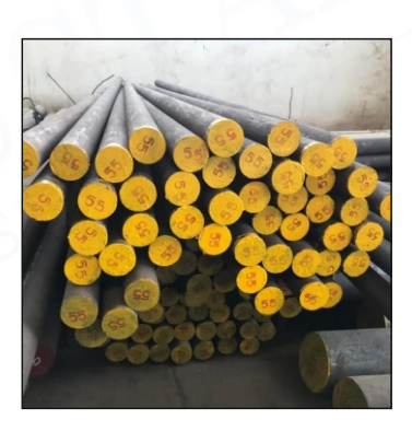
AISI 52100 / EN 31